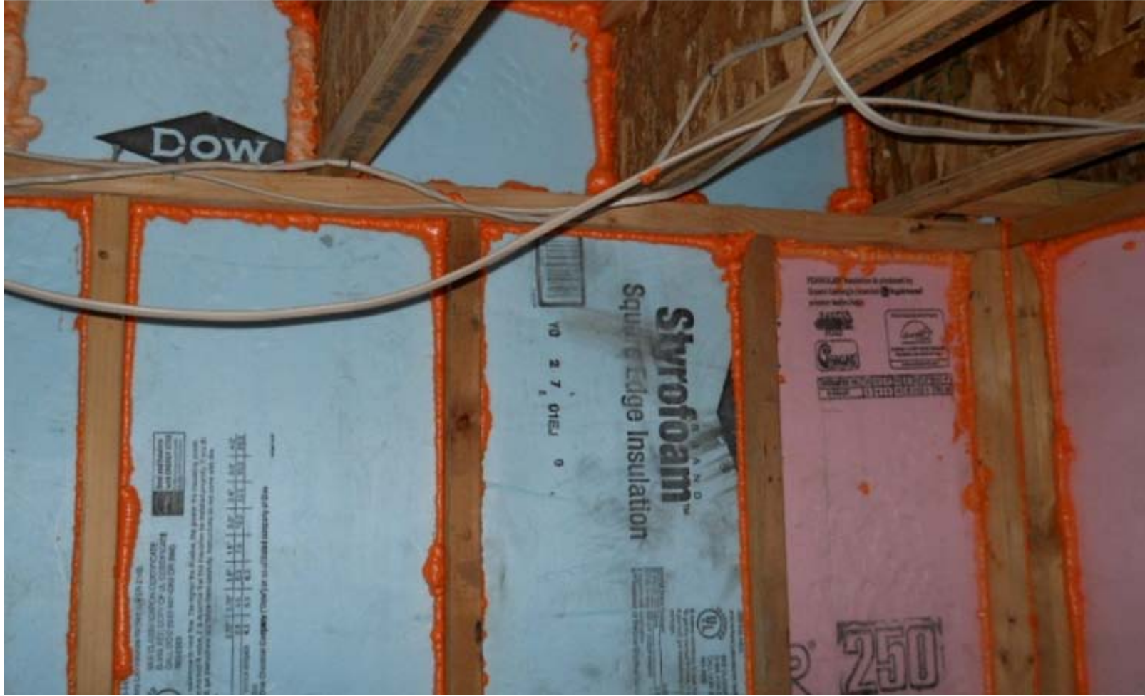
Air sealing and rigid foam insulation in crawl space