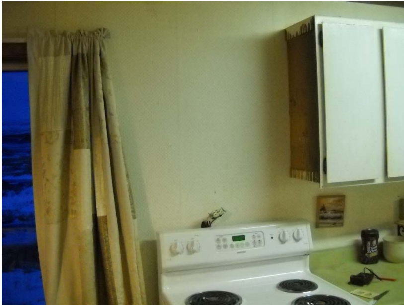
Stove without range hood exhaust