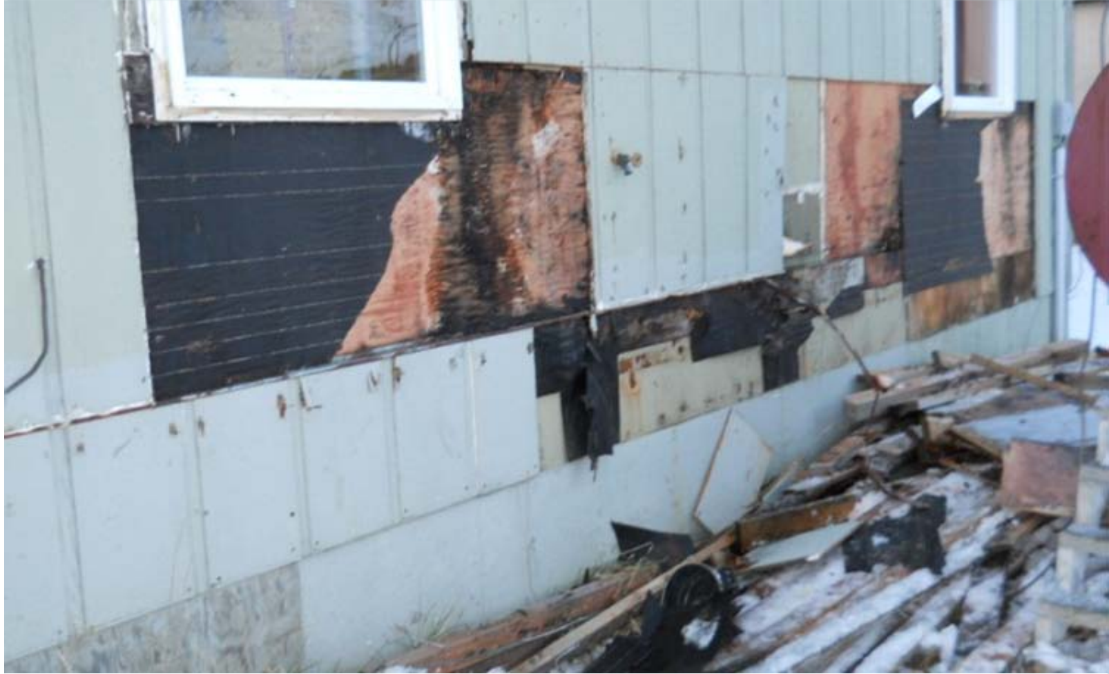
Water damage from leaking windows