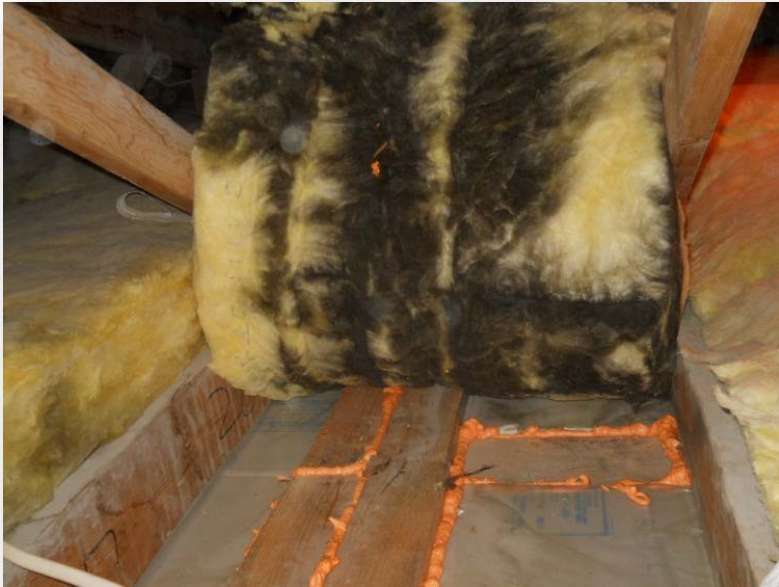
Sealed air leak at wall penetration in attic