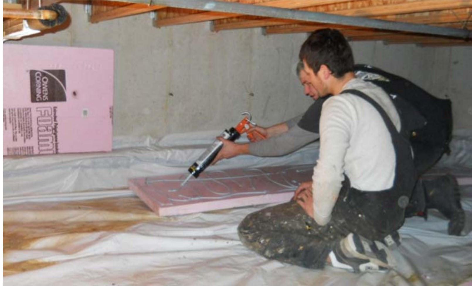
Installing rigid foam insulation on cement walls