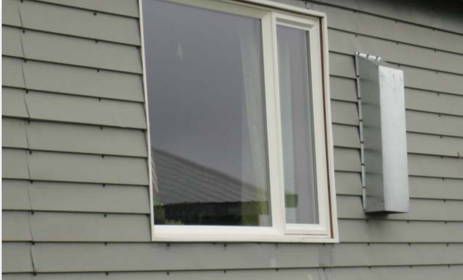
Wind baffle over new range hood exhaust