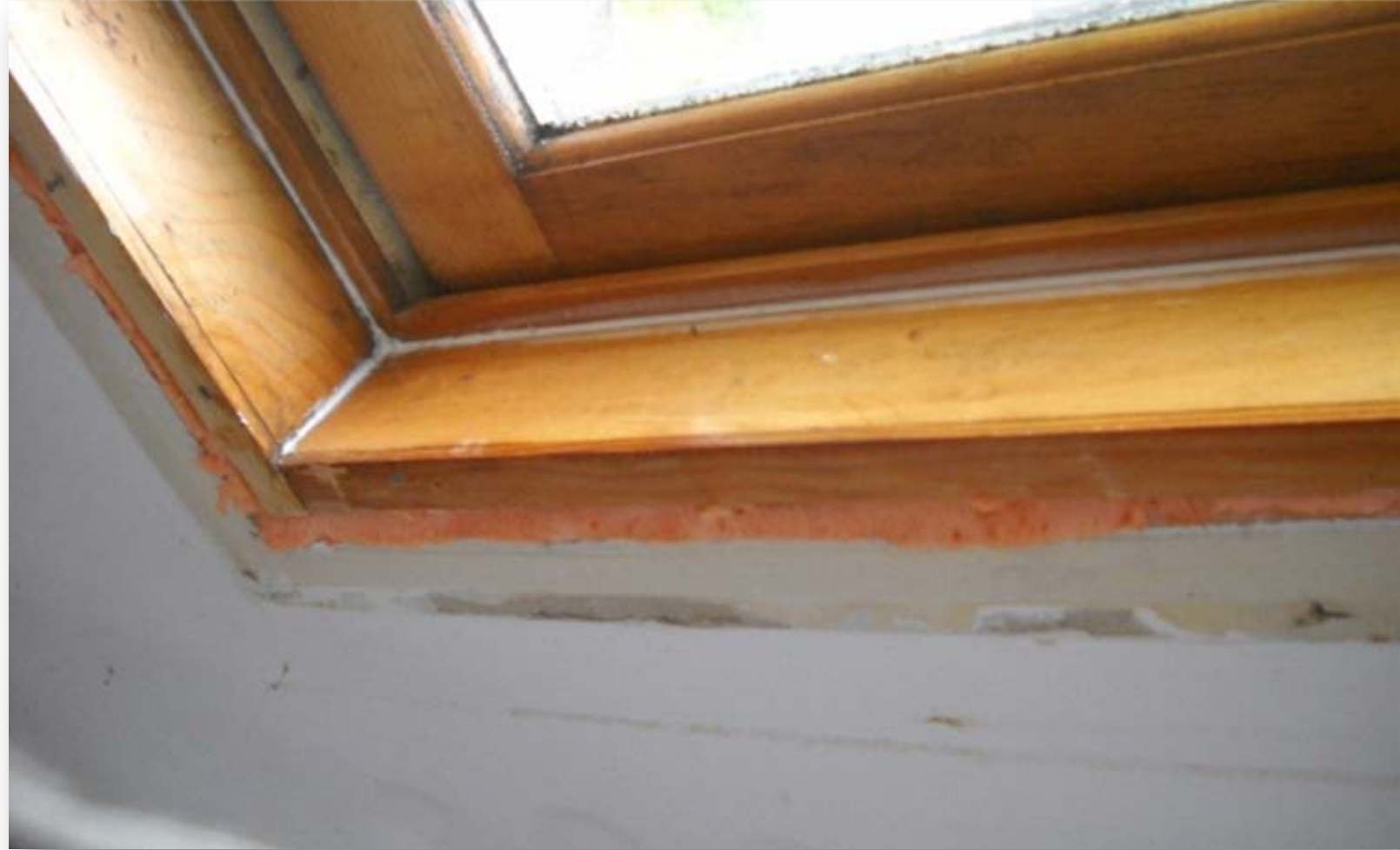
Existing window jamb - sealed